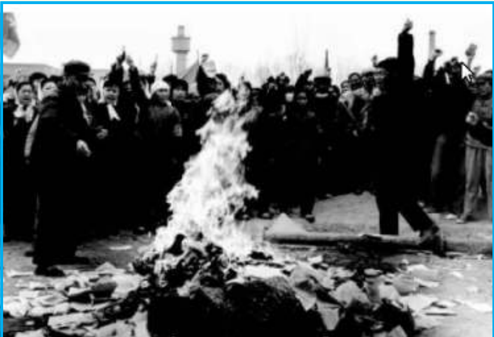
Millions of books (including Bibles) were burned during the Cultural Revolution, creating a famine regarding the Word of God in China.