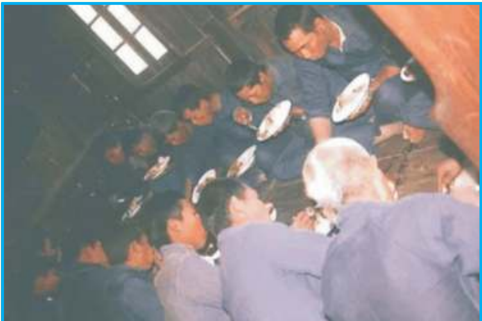
Inmates at a prison labour camp in China in the 1970s.

News of the pastor's return spread throughout the neighbourhood like wildfire, and soon the shining faces of many other believers pressed against the windows of a house he was invited to stay in. Many people were beside themselves with both shock and joy. They presumed the pastor had died decades earlier,